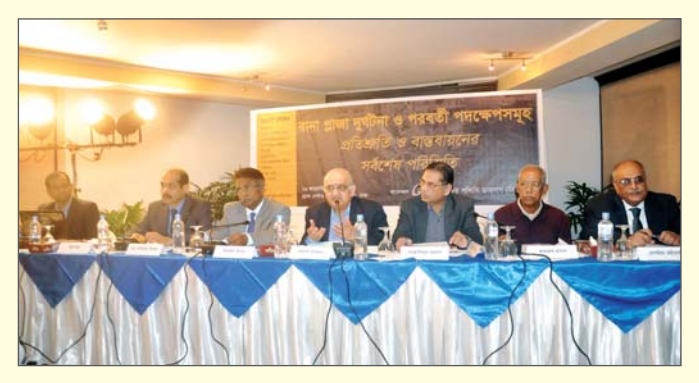
The second dialogue discussants underscored that despite significant efforts the implementation status of post-Rana Plaza deliverables was rather mixed

Emergence of these topics accordingly mounted pressure on the responsible authorities so that appropriate and adequate actions are taken.