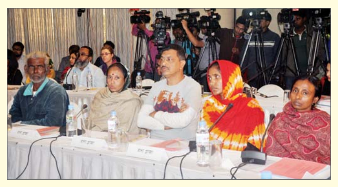
Victims attending the second dialogue described their on looking depressing future and rehabilitation prospect

towards disbursing compensation and humanitarian aid for workers, treatment and rehabilitation.