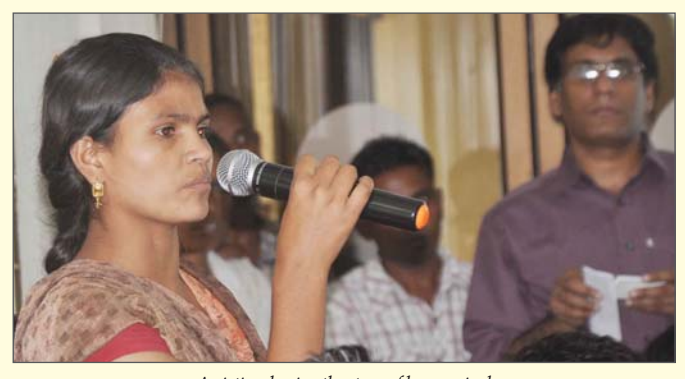
A victim sharing the story of her survival

Recommendations from various stakeholders in the audience, including Members of Parliament, civil society organisations, representatives from business chambers and trade unions, human