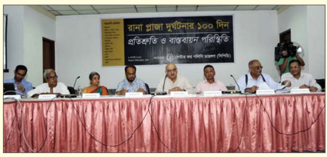
The podium at the first dialogue emphasised on consolidation of efforts from various stakeholders to address the unfulfilled immediate needs of the Rana Plaza victims

Following hundred days since the tragic incident, CPD along with its partners organised the first national dialogue of the initiative on 3 August 2013 titled 100 Days of Rana Plaza Tragedy: A Report on Commitments and Delivery where various industry stakeholders deliberated on the first monitoring report. The key focus was on evaluation of the progress in terms of delivering the commitments towards addressing immediate concerns such as rescue operations, buried deceased workers, immediate treatment for the injured, financial support to the victims and their families, legal initiatives following the tragedy, and identifying structural weaknesses of the sector with regard to workplace safety and security.