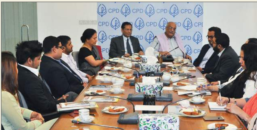
Young trade leaders sharing views on national budget FY2016-17

Young professionals and trade leaders of Bangladesh felt the need of platforms where their voices on the issues of national interest will be heard and considered while designing the future development of the country. They suggested that there should be forums and also network of youths both in Dhaka and outside, and their views must reach to the policymakers. This would not only help them addressing the challenges they are facing in running their businesses and activities, but would also facilitate making their contribution to the country's development.