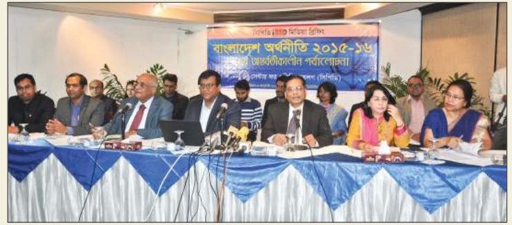
CPD researchers presenting the State of the Bangladesh Economy in FY2015-16 (First Reading)

The event was attended by eminent citizens, scholars, political leaders, development practitioners, diplomats among others.